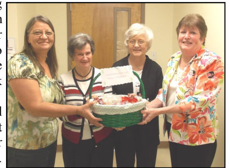
“Penny Wars” Winner Justice Court

With so many new diagnoses of cancer it truly brings relay home for our team and reminds us why we walk together. It is great that we came together as fellow employees to make a difference in the fight against cancer. Please pray for everyone fighting this disease and pray for a day with no more cancer.