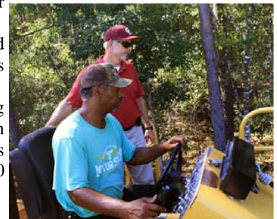
Photo Gallery Relay for Life 2014