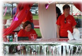
Photo Gallery Relay for Life 2013

First be informed of all the hazards that can affect our area from a hurricane including strong winds, tornadoes, and flooding. Then make a plan for what you and your family will do should a hurricane threaten our area. Decide if you will evacuate or stay home. If you plan to stay in a public shelter know what to bring with you. If you have pets make plans for them also. Finally make a disaster supply kit. Includes items such as non-perishable food, water, flashlights, extra batteries, battery powered radio, toiletry items, pet food, etc. For more information on preparedness visit www.ready.gov or www.msema.org . Also, the American Red Cross has a free hurricane app you can download for your phone. Remember preparing for a storm now will keep you and your family safe later.